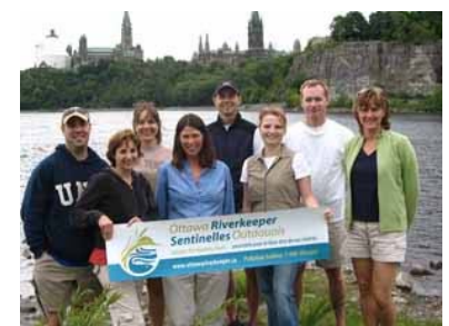
Team of volunteers with Riverkeeper

Our organization has been successful and effective thanks to the help of many skilled and enthusiastic volunteers who believe in our mission. We have four committees that bring expertise from our community to help Ottawa Riverkeeper. Our science committee has 12 scientists from academia, government and consulting companies that meet once a month to discuss the science behind emerging issues and current research. Our outreach committee of 6 professionals is working to bring our message to diverse audiences. Over 35 volunteers worked on the River Report in capacities as diverse as scientific research, mapping, photography, editing, translation, communication and graphic design. Hundreds of volunteers organize and participate in our stream cleanups throughout the watershed. We have no shortage of people who want to help, only staff capacity to guide and engage the volunteers.