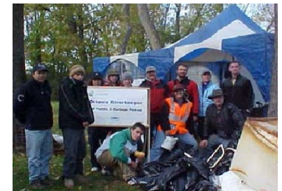
2006 Fall Paddle and Garbage Pickup