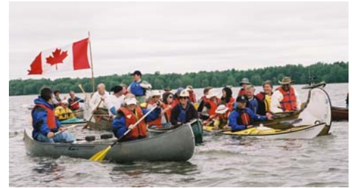
Canadian Rivers Day paddle on the Ottawa River, June 2006.

Ottawa Riverkeeper is invited to participate in numerous events throughout the year. We typically bring a booth with relevant information and news as well as a staff or volunteers to answer questions or concerns about the river.