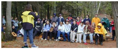
The Riverkeeper talks to high school students about the Ottawa River at the annual Envirothon.

This year, a volunteer outreach committee that consists of experienced educators is committed to expanding Ottawa Riverkeeper's outreach program. Our goal is to engage youth and we will be targeting school kids as well as scouts and brownies to educate youth on water related concepts.